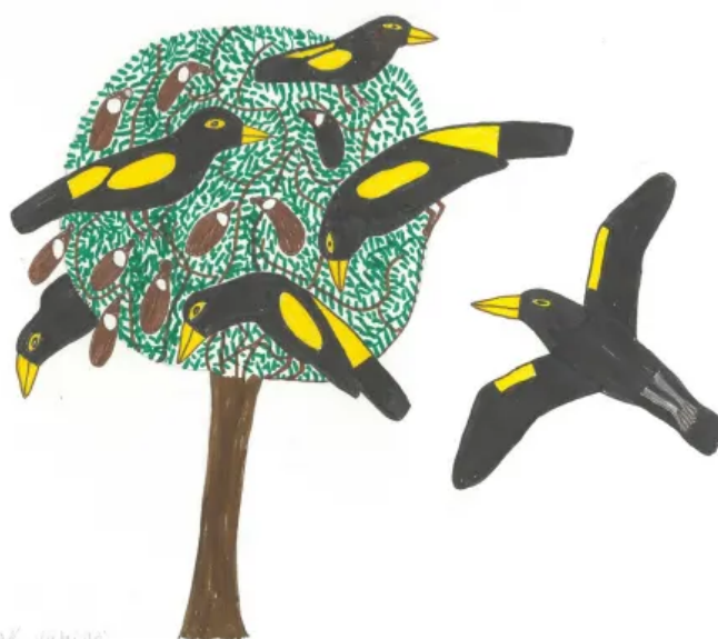
Joseca's 'Untitled' (2002-10) © Joseca

The exhibition debunks the idea that humans are masters of creation, arguing that plants are not ‘less’ — just radically different