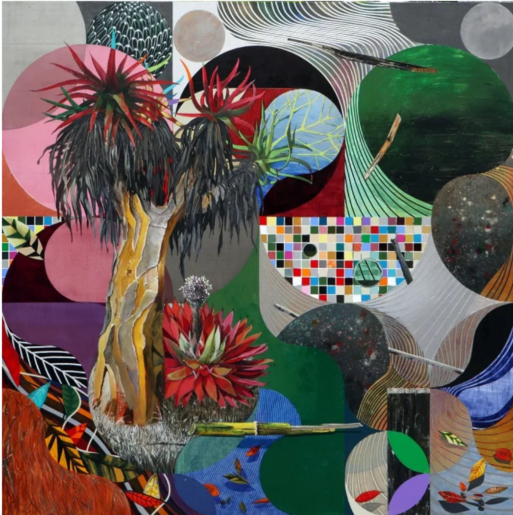
Luiz Zerbini's 'Cabeça d'Água' (2016) © Mark Blower

These canvases suggest that we humans, having crafted our way out of the trees and developed those crafts on an industrial scale, can perhaps learn an even neater trick and make the whole human adventure last beyond this current, rapine moment.