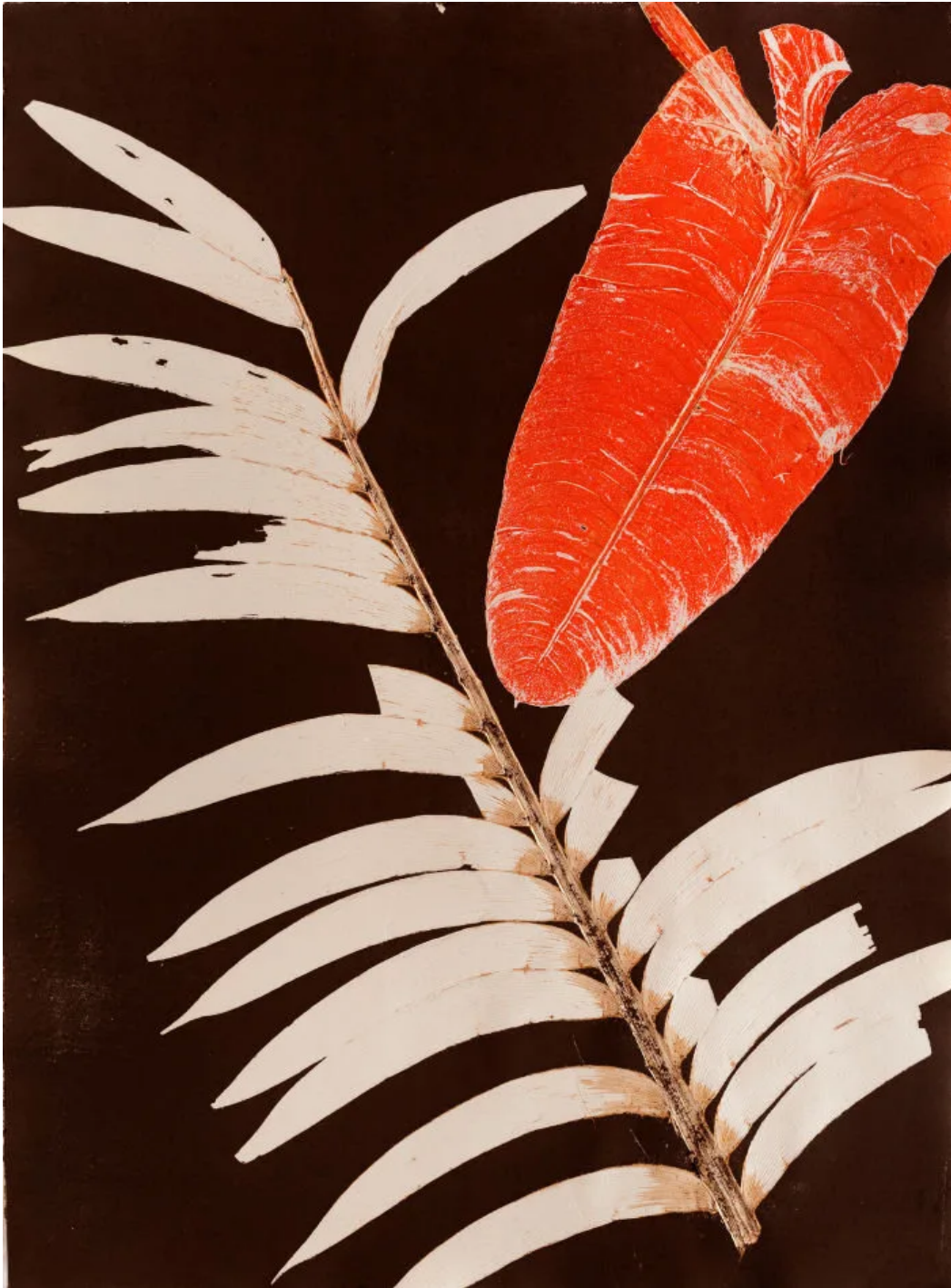
Luiz Zerbini's 'Philodendron Vermelho I', 2018 © Luiz Zerbini/Pat Kilgor

I came out of this show happy. I wasn't just enthused. I'd been converted.