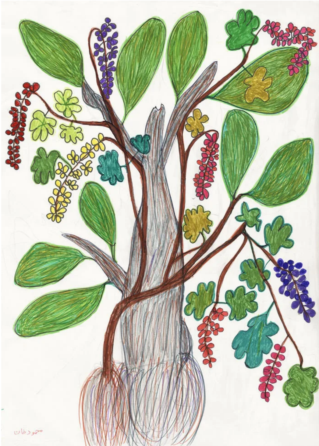
Mahmoud Khan's 'Untitled', 2019 © Mahmoud Khan